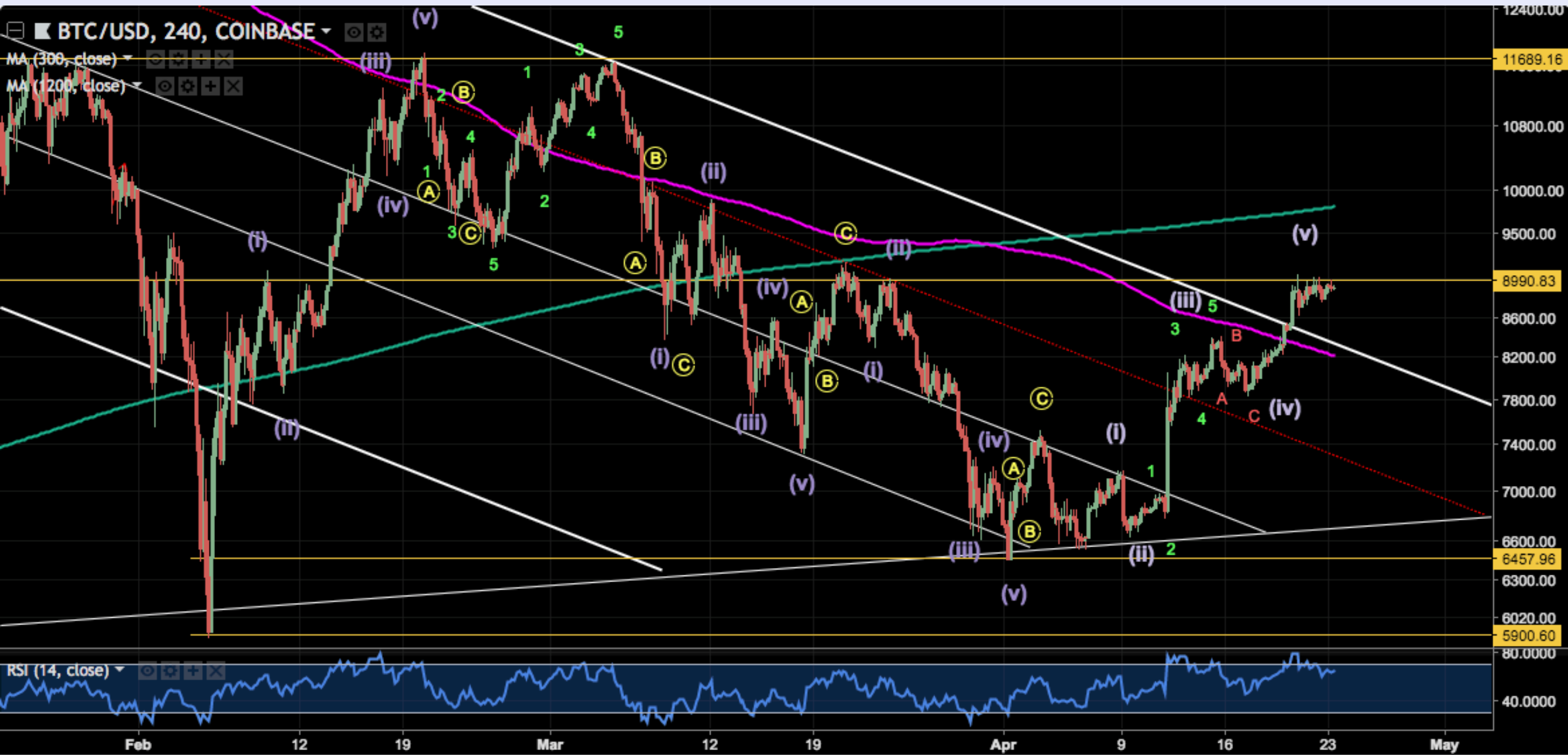
Basic / Advanced Technical analysis tools – Short term analysis