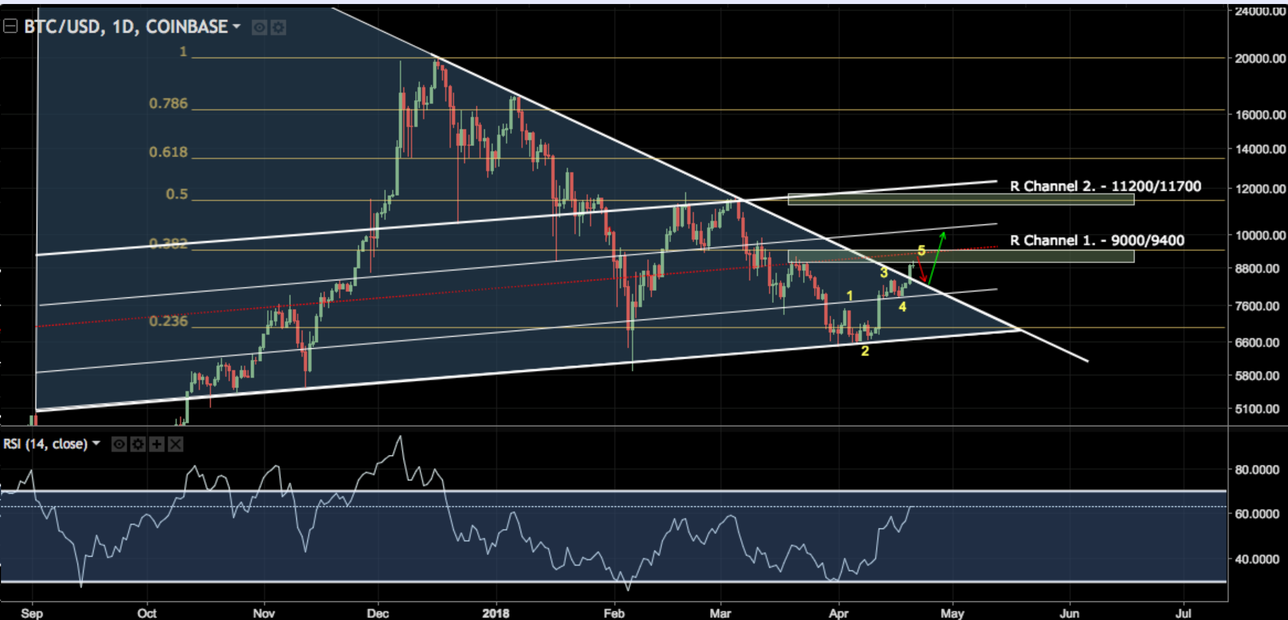
Bitcoin down move 2014 compared to 2018