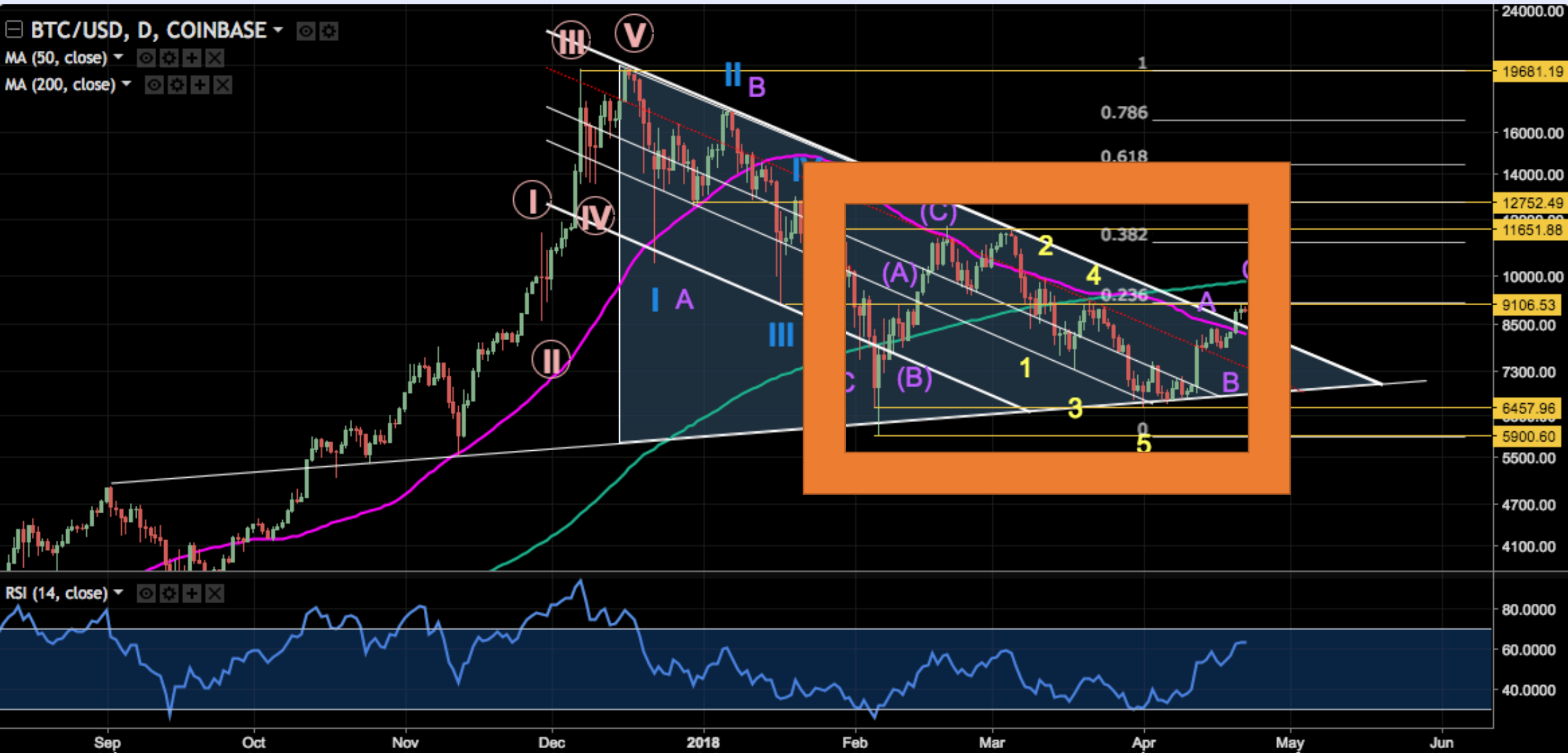
Basic / Advanced Technical analysis tools – Long term analysis